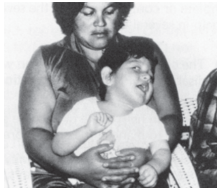
A child with severe cerebral palsy, who is also blind, has seizures, and is mentally slow.

There are several ways in which the community can give assistance to the family of a severely disabled child. In some countries (usually wealthier ones), the most severely disabled, mentally slow children may be taken care of in special care centers, or ' institutions '. Although in many cases it is better for the disabled child to stay at home with his own family, there are times when institutional care is needed. This may be because of difficulties in the home situation. Or it may be because the multiply disabled child requires more time and skill than the family can handle.